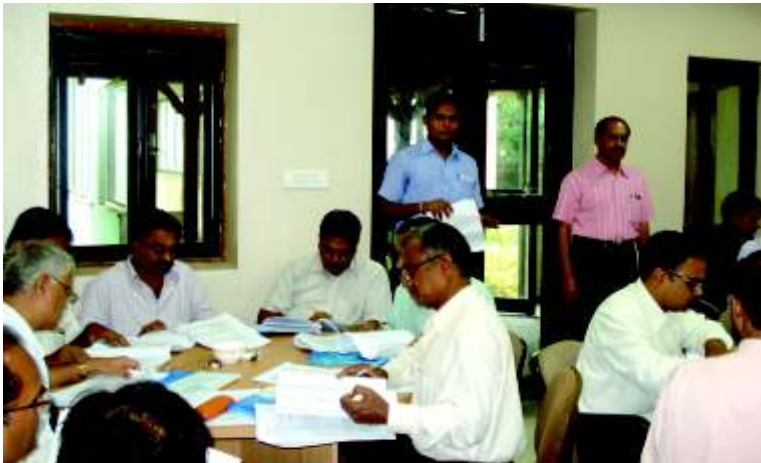
Participants of RTI Act 2005 engaged in group discussion