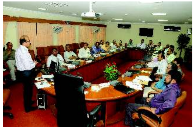
Shri Uday Shinde, DAG, addressing the participants of Pilot Training on Reporting